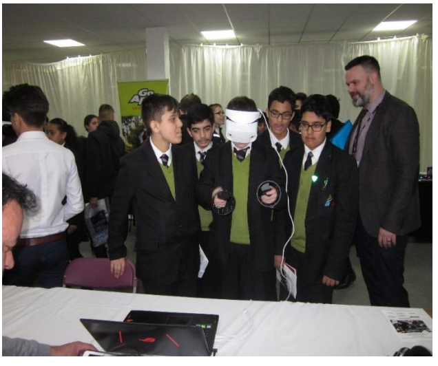
Trying out the simulator